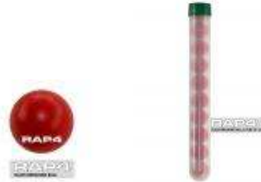
Glass Breaking Balls (Tube of 10) [9090]

Glass Breaking Balls are .68 caliber projectiles. These balls are ideal for breaking vehicular and structural windows, and are ideally followed by the Less Lethal Capsaicin Projectiles from the SplitFire's secondary ammunition source (magazine or hopper).