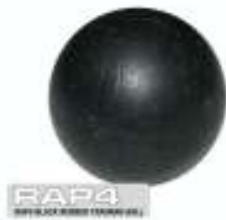
Black Rubber Pain Compliance and Training Balls (Bag of 500) [5534]

These are training balls but are also the hardest balls and are used for pain compliance. This is not to be confused with rubber bullets or WASP rounds or bean bag rounds. These balls will hurt, but unlike true "rubber bullet" ammunition they do not have knock down power to incapacitate an attacker, and should not be relied upon to do so. They hurt and sting badly, but will not knock the wind out of an attacker.