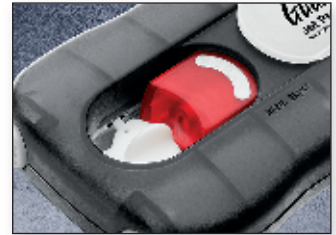
Conventional trigger is shielded by swing-away safety tab to protect against accidental discharge.