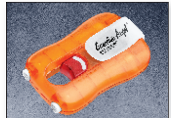
Inert orange Guardian Angel training unit with blue marker die is also available.