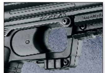
Conventional double action only trigger with smooth pull and pronounced release point. Reset is automatic.