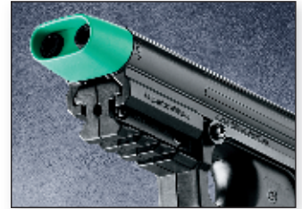
Standard features include Picatinny rail for mounting accessories or lights. Integral laser sight is optional.