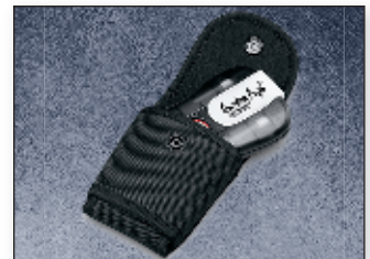
For additional carry options, a black cordura carry pouch is sold separately.