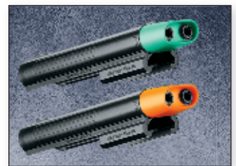
Extra two-shot magazines quickly snap into position. In addition to live OC, inert training magazines with dye are also available.